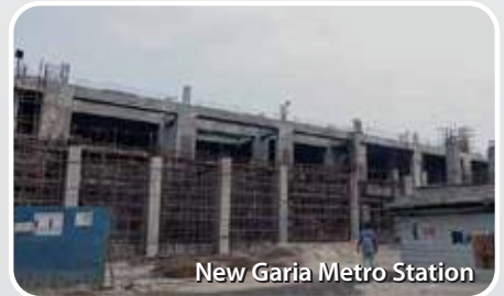
New Garia Metro Station