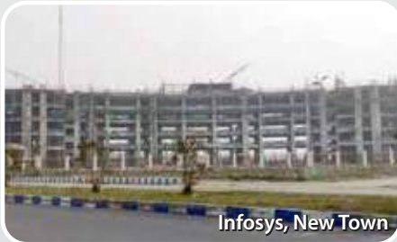
Infosys, New Town